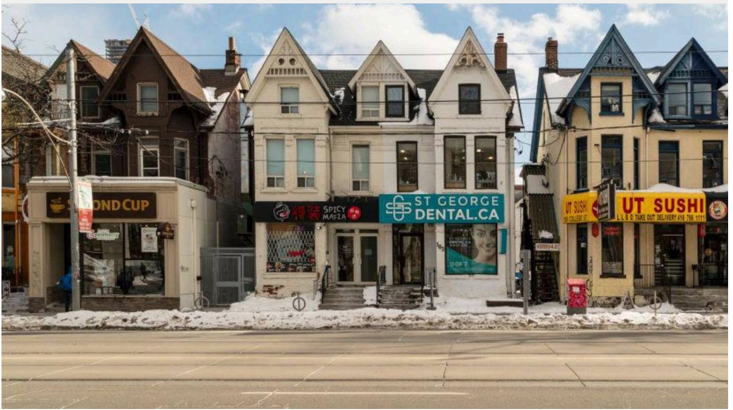
Bay-and-Gable homes have been transformed into businesses along College.

Bay-and-gable homes and their influence on Toronto's current and former architectural styles have also been recently studied to inform real estate development.